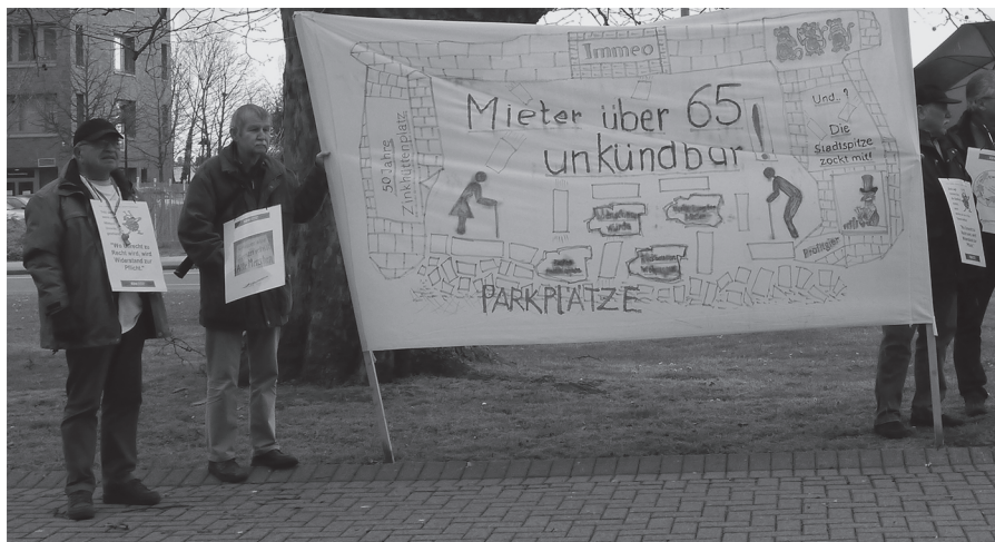
Demonstration Ruhr Metropolitan Area