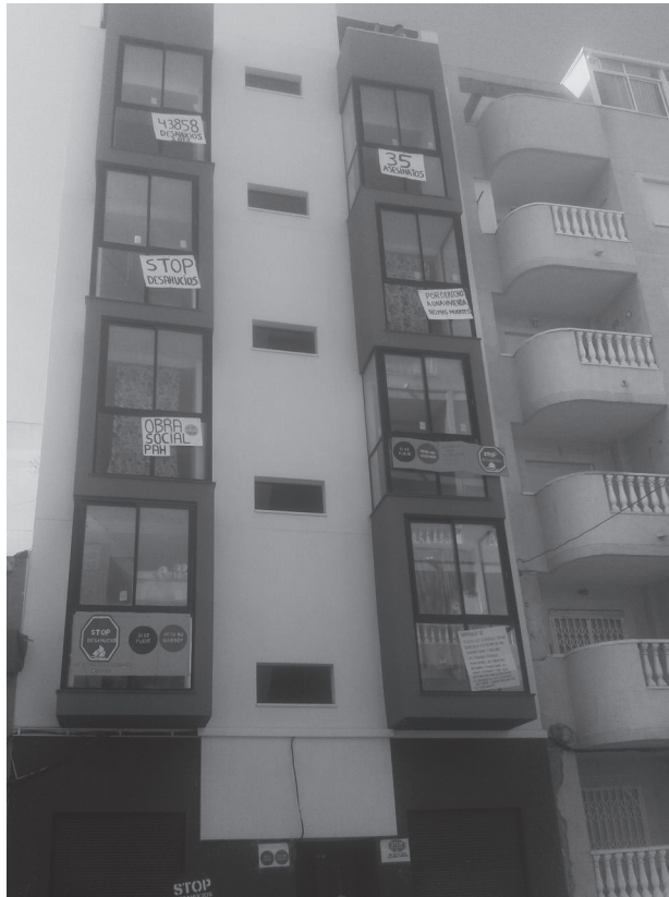
Spanish State “Stop Evictions”