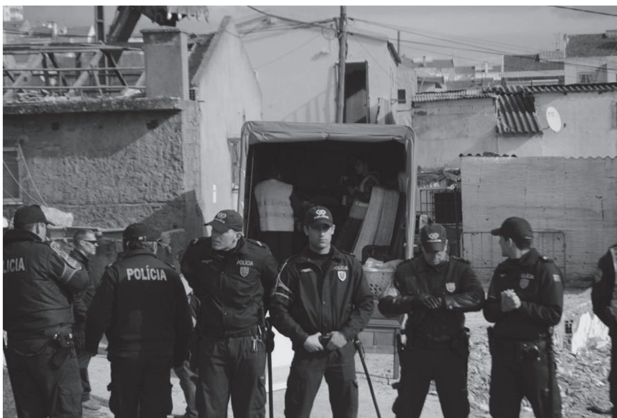
Demolitions and evictions in Portugal