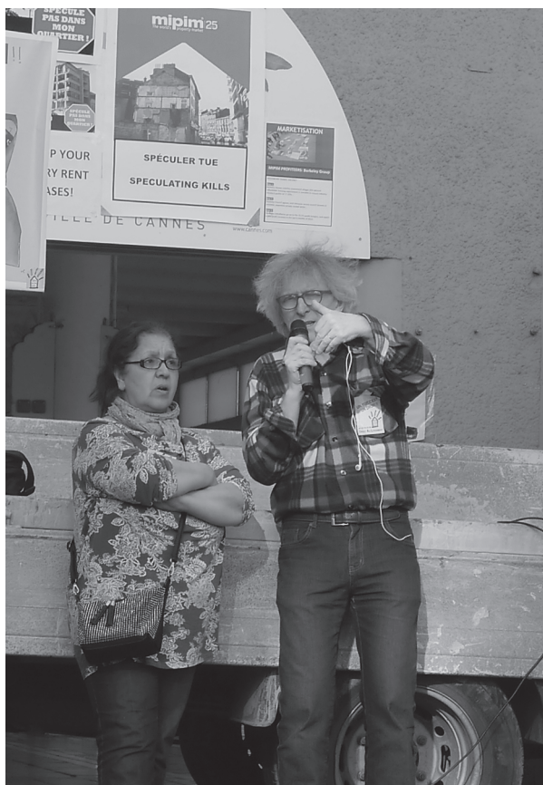
Cannes, Tribunal Anti MIPIM