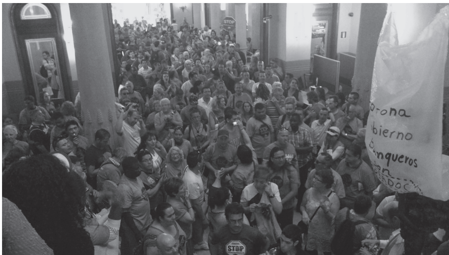
Occupation of a bank in Spanish State