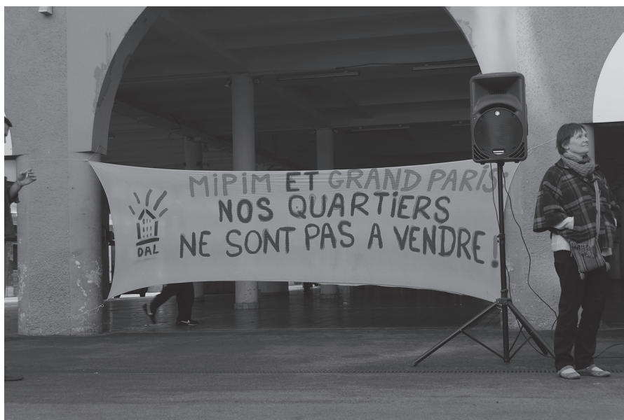
Cannes, Tribunal Anti-MIPIM

they are confidential. Common sense says that a viability system that allows a developer to make massive profits and yet deliver few affordable homes must be fundamentally flawed.